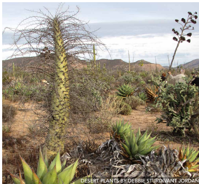
DESERT PLANTS BY DEBBIE STURDIVANT JORDAN

This natural and cultural expedition traverses Mexico's Baja Peninsula through desert, mountain, and coastal habitats between the Sea of Cortez and Pacific Ocean. A highlight will be three excursions to observe gray whales who migrate here from the Arctic. To get close (often an arm's length away!) you'll board small, 8–12 passenger panga boats for excursions of up to 3 hours. Some panga rides feature small waves or swells; at some beachheads you'll wade in foot-deep water to embark or disembark. There are several short walks on flat but sometimes uneven terrain; and one optional short, steep hike. Other activities include exploring villages, farms and historic missions; birdwatching; and optional snorkeling with sea lions. Average winter high temperatures range between 59°–70°F; mountain temperatures occasionally fall below freezing at night. Your 935-mile route from La Paz to San Diego involves drives of 1–5 hours in comfortable, air-conditioned, private charter buses or vans; stopping in rest areas whose facilities range from modern to rustic.