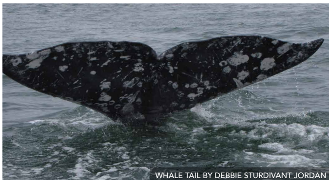
WHALE TAIL BY DEBBIE STURDIVANT JORDAN

This program includes optional carbon offsetting with ClimateSafe. Learn more at holbrooktravel.com/climatesafe