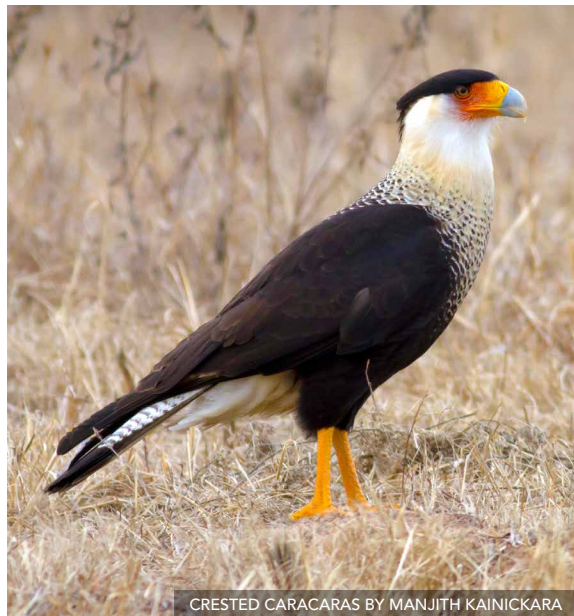
CRESTED CARACARAS

Continue the drive to Cataviña with a nature walk in an area rich with desert vegetation. Enter Reserva de los Cirios, named in honor of the Boojum tree, Baja's signature plant. Arrive in the famed Cataviña boulder fields located in the enchanting Central Desert. A combination of sun, sand, gigantic granite boulders, Boojum trees, cardon cacti, and elephant trees create a superb desert garden landscape. Settle in at the hotel and enjoy a dinner fiesta this evening. Overnight at Misión Santa Maria. (BLD)